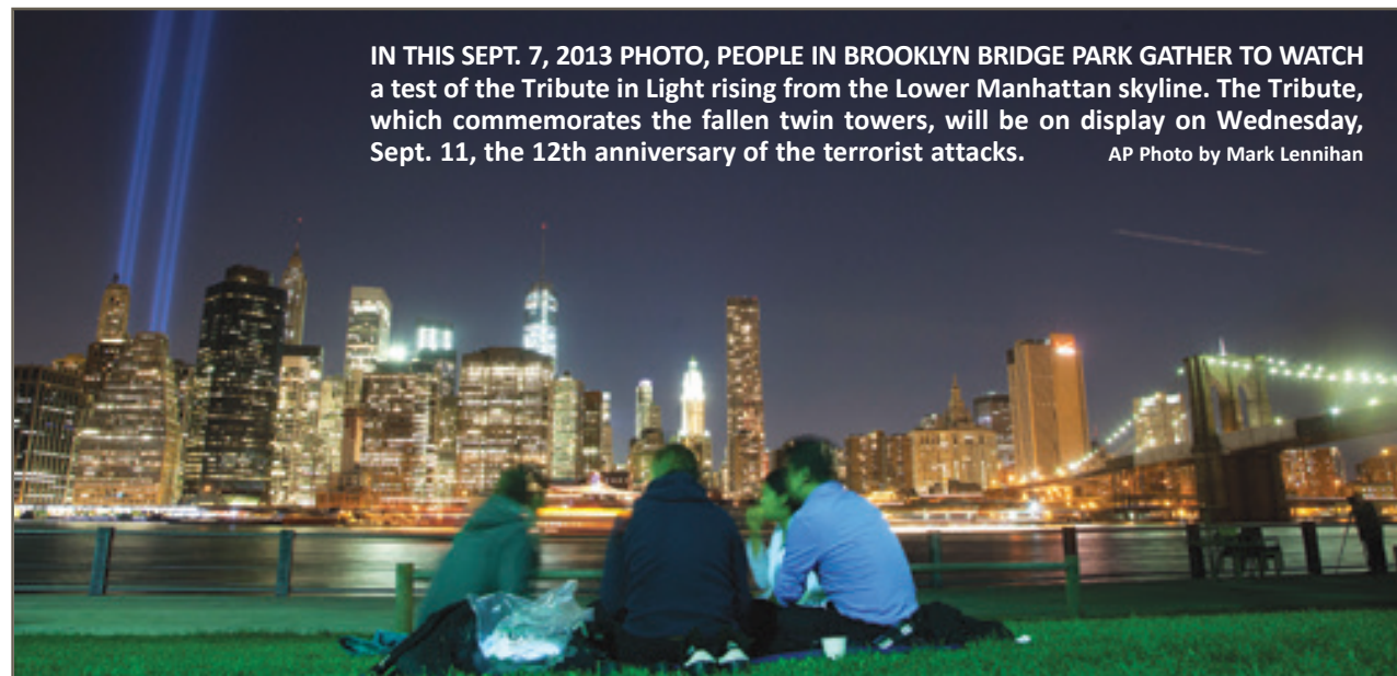
IN THIS SEPT. 7, 2013 PHOTO, PEOPLE IN BROOKLYN BRIDGE PARK GATHER TO WATCH a test of the Tribute in Light rising from the Lower Manhattan skyline. The Tribute, which commemorates the fallen twin towers, will be on display on Wednesday, Sept. 11, the 12th anniversary of the terrorist attacks.

Public Advocate Bill de Blasio, according to the polls, appears poised to win it all. The Wall Street Journal reported on its website that de Blasio had 36 percent of the vote. But the outcome of the primary was far from certain. A candidate must Please turn to page 2