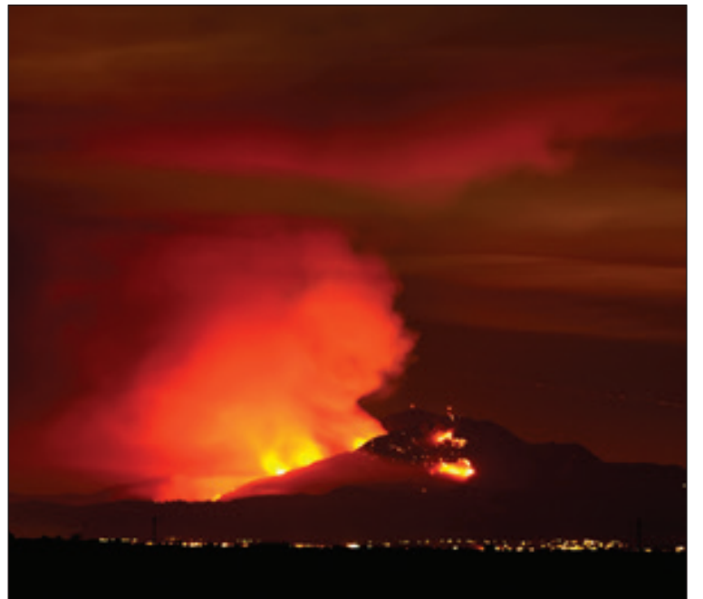
BAY AREA WILDFIRE: A wildfire burns out of control on the slopes of Mount Diablo in Contra Costa County, Calif. By nightfall on Sunday it had surged to 800 acres, spewing a plume of smoke visible for miles and leading to the evacuation of 50 to 75 homes in Clayton, a town of about 11,000 people.