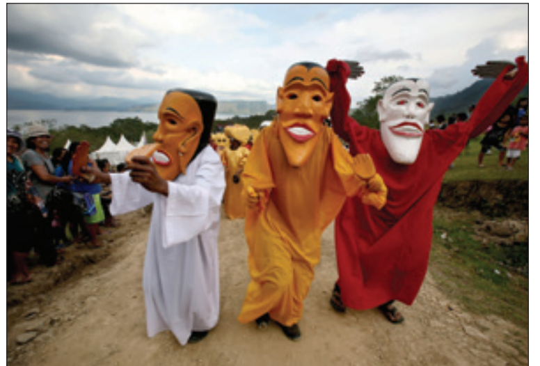
TRADITIONAL DANCE: Artists perform a traditional mask dance called Gundala Gundala during the Lake Toba Festival on Samosir Island, North Sumatra, Indonesia. The cultural festival is held annually to promote tourism in the region.