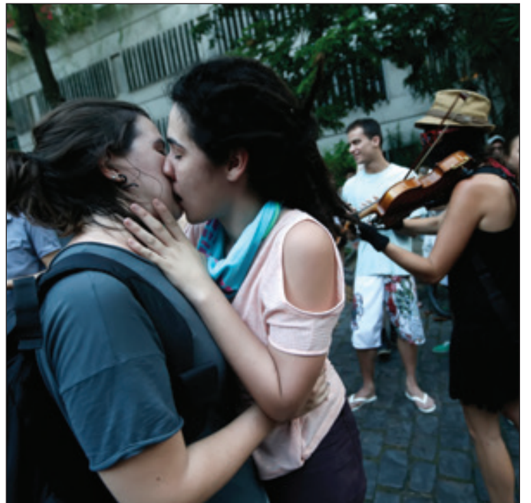
GAY PROTEST IN BRAZIL: Demonstrators kiss in front of the Russian consulate during a protest in Rio de Janeiro. About a hundred gay rights supporters carried placards and chanted slogans outside the Russian consulate to protest Moscow's policies on homosexuality.