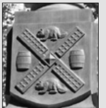
NYC plaque pays homage to the Dutch origins of our area. Windmill reproductions can still be seen all over Kings County.