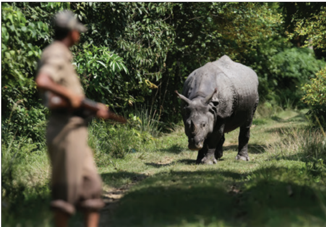
RHINOS HEAD FOR THE HILLS: A forest guard takes position as a one-horned rhinoceros walks to higher land at the flooded Pobitora wildlife sanctuary in Assam, India. Assam is home to the world's largest concentration of the rare rhino. According to the Press Trust of India, 90 percent of the sanctuary has been inundated by overflowing rivers, forcing animals to migrate to higher grounds.