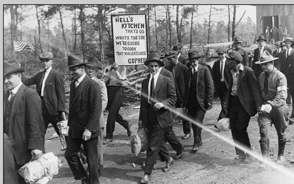
Recruits from inner city arrive for training.

In World War I, 750 Brooklyn men leave for Camp Upton in Yaphank, Long Island.