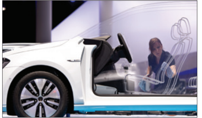
NO MORE BEETLE: A cutaway model of the new e-Golf by Volkswagen is being cleaned by an employee at the Frankfurt Auto Show in Frankfurt, Germany. The 65th IAA will take place from Sept. 12 until Sept. 22.