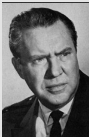
Edmund O'Brien was born in Brooklyn on September 10, 1915. He gave fine performances in many films, one for which he won an Oscar. He was also a television star and film director.

Edmund O'Brien died of Alzheimer's Disease on May 8, 1985.