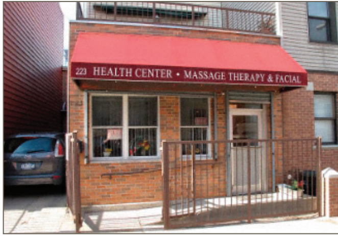
"HEALTH CENTER MASSAGE THERAPY" at 223 Cayler St., Greenpoint, one of the alleged prostitution locations named in the indictment.

The second indictment charges two defendants with Promoting Prostitution and related charges. According to the indictment, primary