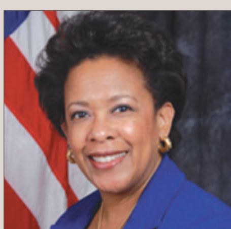
LORETTA LYNCH, U.S. ATTORNEY FOR THE Eastern District of N.Y., based in Brooklyn