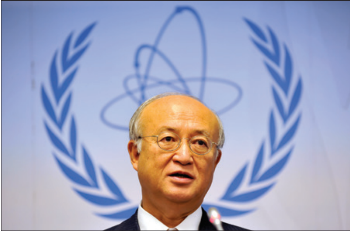
NUCLEAR DANGER IN THE MIDEAST: Yukiya Amano of Japan, director general of the International Atomic Energy Agency (IAEA), speaks during a news conference at the International Center in Vienna, Austria. Diplomats say that Russia is pressing the U.N. atomic agency to report on the nuclear risk of air strikes on Syria in efforts to stave off a possible U.S. attack.