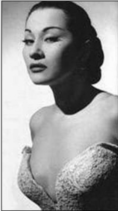
Yma Sumac, Brooklynite

ICHOCAN, PERU — Spell Amy Camus backwards and what do you get? Yma Sumac. She was born on September 10, 1922. It does seem authentic that she was born in Ichocan, Peru, but it has long been rumored that Yma was born Amy Camus in Brooklyn and grew up here. One source, The Motion Picture Guide (by CineBooks), in a review of one of her movies, states that she was a Brooklynite posing as a Peruvian. Her publicity agents claimed she was an Incan princess, a direct descendent from Athualpa, the last emperor of the Inca Empire.