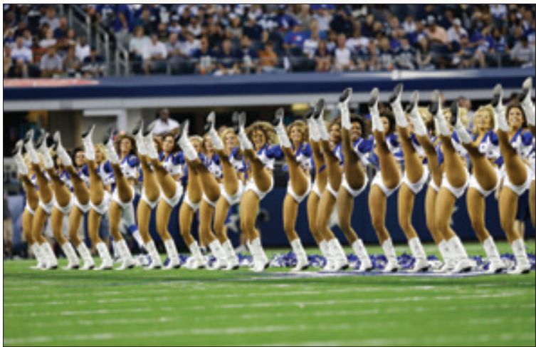
COWBOY CHEERLEADERS: The Dallas Cowboy cheerleaders perform before the Cowboys' NFL game against the New York Giants on Sunday in Arlington, Texas.