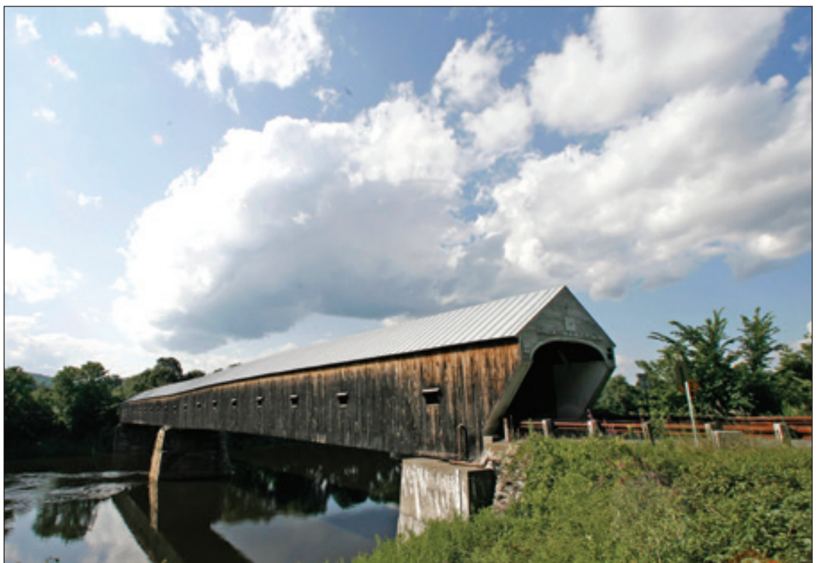
HISTORIC COVERED BRIDGE: The Cornish-Windsor bridge spans the Connecticut River in Windsor, Vt. Repairs are starting on one of the longest covered bridges in the United States, which connects New Hampshire and Vermont. The two-lane bridge is going down to a single lane for up to eight weeks starting this week.